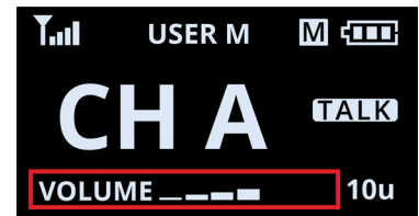
Figure 2: Volume Setting