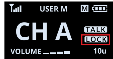
Figure 1: Lock Indicator