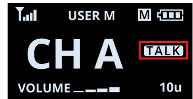
Figure 3: Talk Indicator