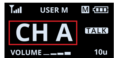
Figure 4: Channel Indicator