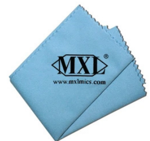
Microfiber Cleaning cloth