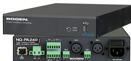
Models NQ-PA120 & NQ-PA240