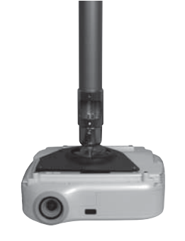
PJF2 with Model-Specific Adapter Plate*