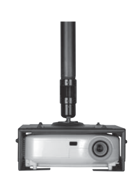
PJF2 with Clamp-Style Universal Adapter Plate*