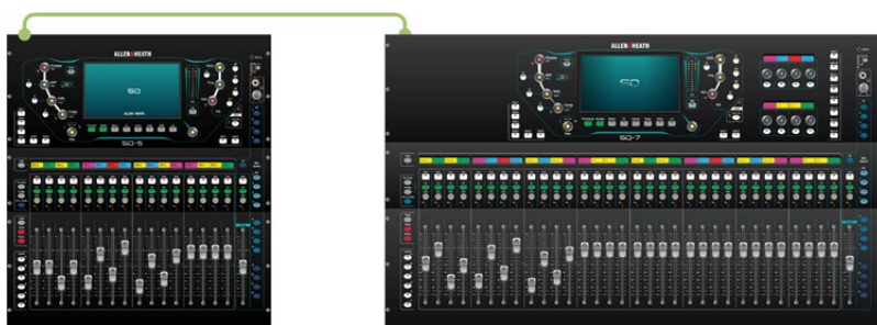
SQ + SQ 128 channels each way