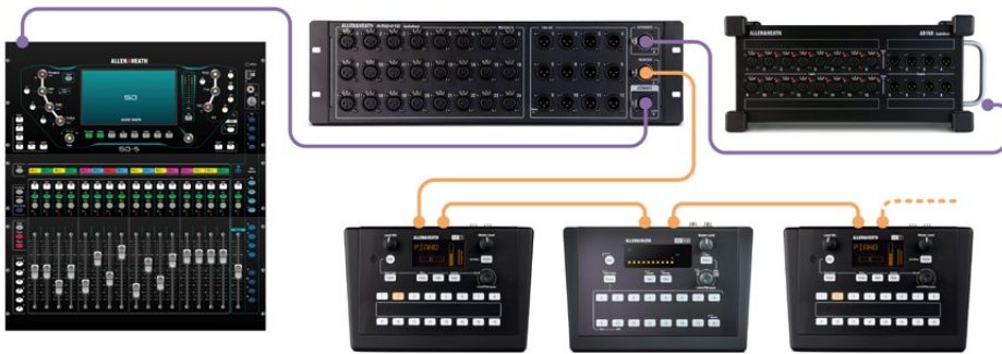
SQ + AR2412 + AB168 + ME system 40 remote inputs + 20 remote outputs + ME system