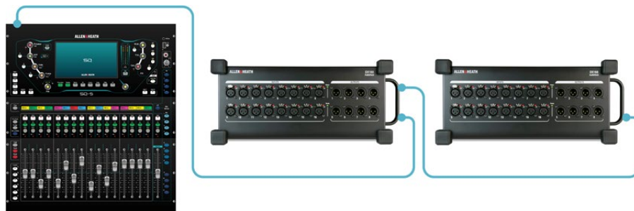
SQ + 2 x DX168 32 remote inputs + 16 remote outputs