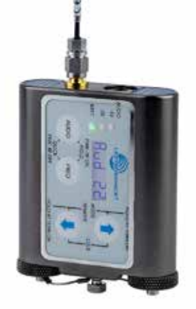
Digital Hybrid Wireless® U.S. Patent 7,225,135