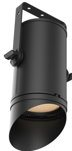
Half Snoot Kit