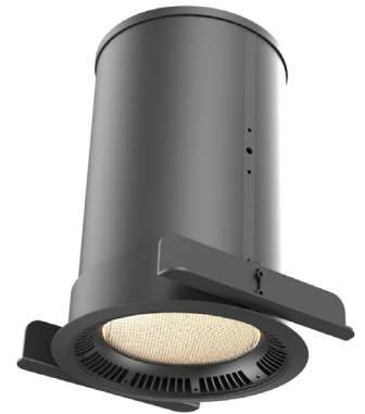
Recessed Ceiling Kit