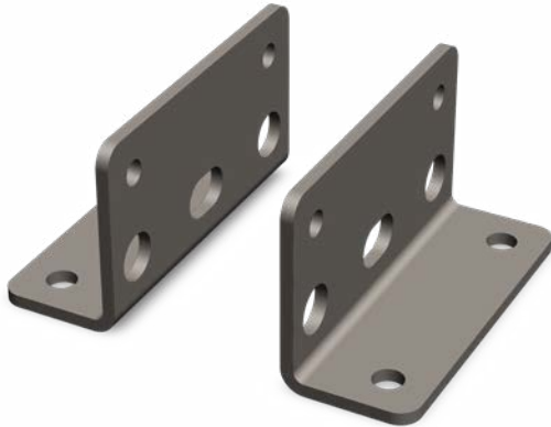
Figure 1: The Mounting Brackets

The Blue POD and Blue POD Solo can be mounted in a variety of positions, including underneath a table or on a wall. The device can be mounted upside down or vertically, if necessary.