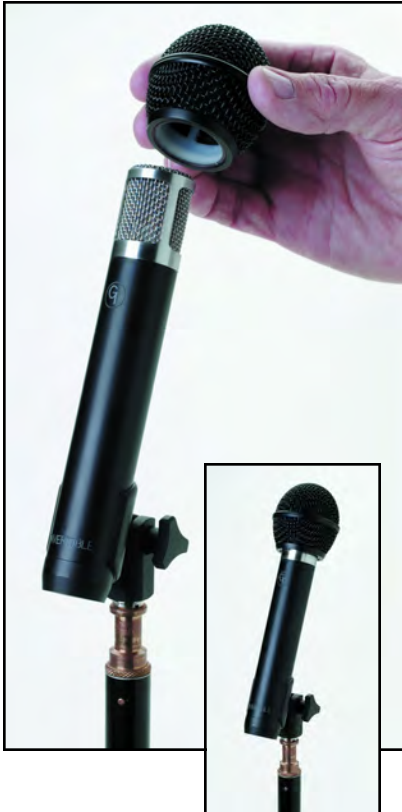
GT CONVERTIBLE FREQUENCY RESPONSE

First glance reveals a hand held "true condenser" (no electret, please!) ball end vocal mic that will greatly enhance the detail in any live vocal performance. But "drop the top" (or, easily unscrew the ball end pop filter) and you'll see a Mid sized Stainless Steel top-firing mic similar to our legendary GT33/44 capsule that is perfect for live stage guitar and instrument productions! The GT Convertible further "converts" from a stage mic back to your favorite studio mic, so it's actually 4 mics in 1!