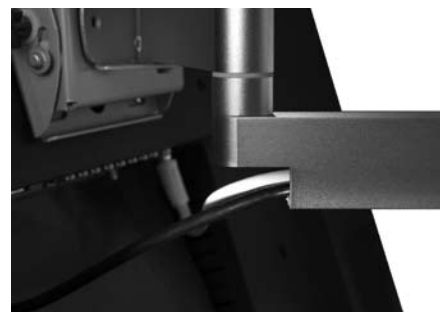
Built-in internal cord management channels