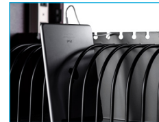
Built-in Compartments FOR STORING AND CHARGING YOUR TABLET/NETBOOKS