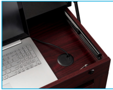
LOCKING LAPTOP COMPARTMENT