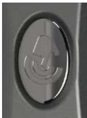
mode slide switch