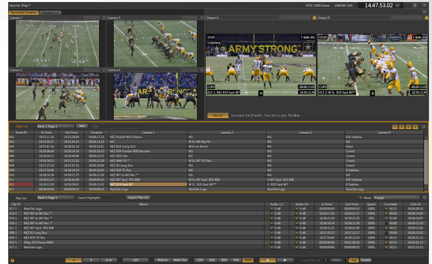
3Play 425 User Interface

© 2017 NewTek, Inc. All rights reserved. TriCaster, 3Play, TalkShow and LightWave 3D are registered trademarks of NewTek, Inc. NDI, MediaDS, LightWave, ProTek, and Broadcast Minds are trademarks and/or service marks of NewTek, Inc.