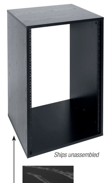
Premium Cathedral Black

wood composite with black woodgrain laminate finish, ships unassembled 16U x 18"D x 20"W