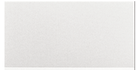
Fine perforation pattern grille.

ured 1W/1M. The system shall include a factory-mounted dual voltage (70/25V) transformer with primary taps at 0.25, 0.5, 1, 2, and 5W and a 0.147 cu.ft. steel backbox with black powder epoxy finish. Speaker connections shall exit the enclosure through a metal clamp.