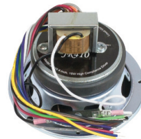
Mounted driver with factory-wired transformer.