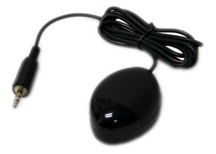
The optional IR extender allows you to relocate your HDMI Switcher and still have IR control of the HDMI Switcher