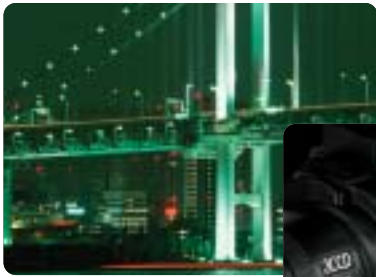
Color Night View Image