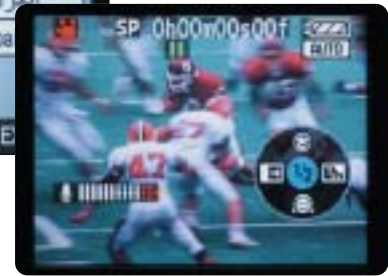
One Touch Navigation