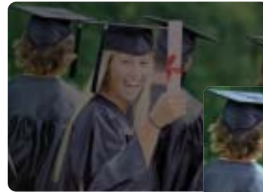
Power LCD "OFF"