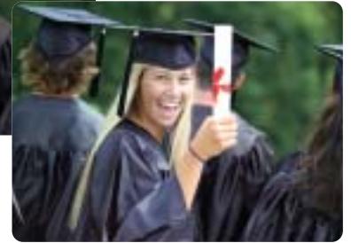
Power LCD "ON"