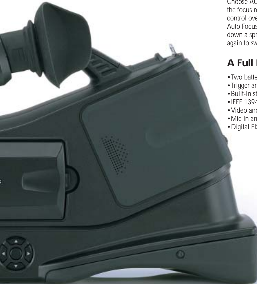
Double trigger and zoom lever on handle grip