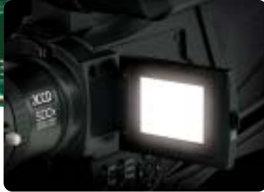
LCD light at 0 Lux Night View mode