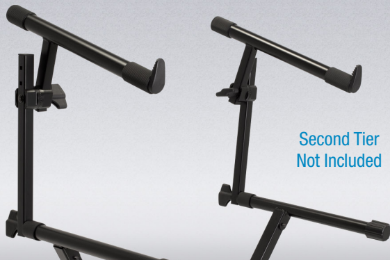
Second Tier Not Included

There are two stabilizing end caps. These caps allow the musician to adjust the stand on uneven surfaces.