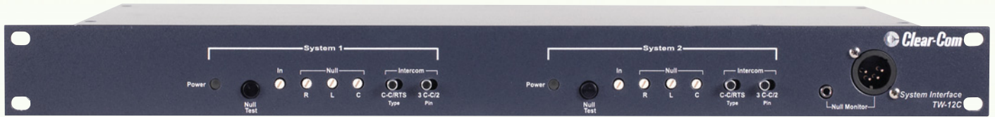
TW-12C Front Panel

Clear-Com's TW-12C intercom system interface is designed for connecting one intercom system to another, without compromising the audio quality of either system.