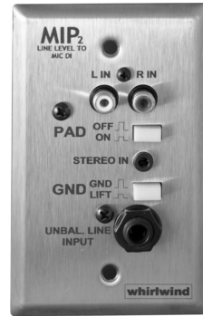
MIP2S (Stainless) MIP2B (Black)

The MIP2 is a one gang wallplate with a mono version of the Whirlwind pcDI computer interface device featuring RCA and 3.5mm stereo input jacks. The line inputs are summed together and sent to the Dimax transformer which balances the output signal and attenuates it by 20 dB.. There is a Pad switch on the MIP2 which attenuates the output signal an additional 20 dB when activated. A Ground Lift switch breaks the ground connection between the inputs and the output screw terminal.