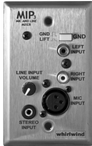
MIP3S (Stainless) MIP3B (Black)

The MIP3 is a one gang wallplate version of the Whirlwind podMIX passive mixing device, combining a microphone with a stereo line level audio source into a single mic level output. A line input Volume control allows level matching and mixing between the music source and the mic. Use it with MP3 players, computer audio outputs, DJ mixers, etc. in banquet halls, gymnasiums and party houses. Works with both dynamic and condenser microphones and passes phantom power from the sound system to the mic input. Line signals are input via a 3.5mm stereo or RCA jacks. The mic input is a balanced female XLR. A Ground Lift switch breaks the ground connection between the inputs and the output screw terminal.