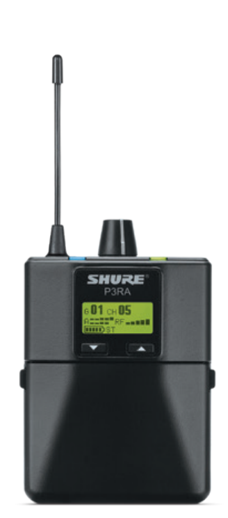
P3RA Premium Wireless Bodypack Receiver