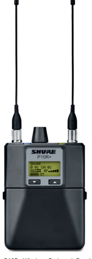
P10R+ Wireless Bodypack Receiver

PSM 1000 is fully networkable with the Shure Wireless Workbench 6 system control software. Work with a friendly interface and more features to manage and monitor wireless performance over the network, from pre-show planning through post-performance analysis.