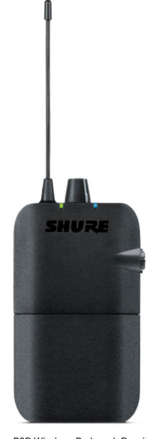
P3R Wireless Bodypack Receiver