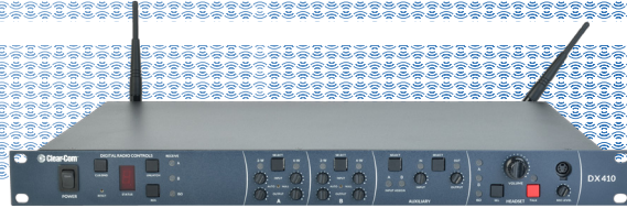
BS410 Base Station