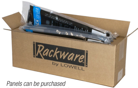
Panels can be purchased individually or in multi-pack cartons.