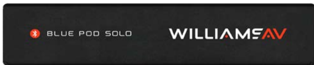
The BluePOD Solo Controller

The B-WAP is powered via the shielded CAT6 cable and requires no other connections.