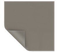
Da-Tex Half Angle: 30° Gain: 1.3