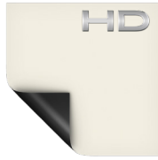
HD Progressive 0.9 Half Angle: 85° Gain: 0.9