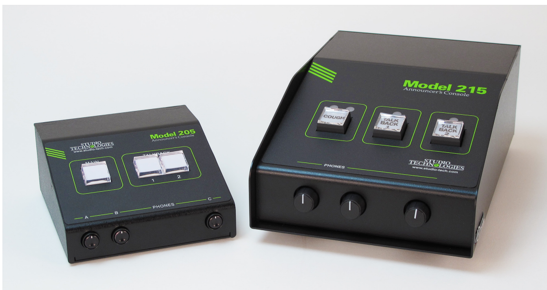
Model 205 Announcer's Console size comparison to Model 215 Announcer's Console (size comparison is identical for Model 204 vs Model 214 Announcer's Consoles)

The user is presented with two pushbutton switches and three push-in/push-out rotary level potentiometers. This makes it easy to control the status of the main and talkback outputs as well as adjusting the signals that are sent to the headphone channels.