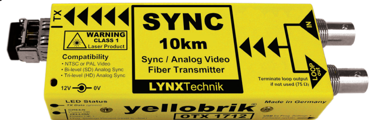
OTX 1712 LC Version Shown

The OTX 1712 provides a passive loop output and support for LC, ST or SC singlemode fiber connections. An LC version suitable for multimode fiber is also available.