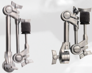
Atlas Pro Scissor Lift Self-Attaching Cymbal Boom Arm with dual Aerodyne Tilters (LAP3S8 & LAP3S5)

Engineered to maximize placement efficiency in the drum set, the Atlas Parts and Accessories Index is the world's first complete assortment of road-worthy mounting tools that actually enhance sonic output from each drum. Using the drums as the base for mounting additional items around the kit, Atlas Accessories allow for unparalleled placement and positioning while reducing the number of needed stands in the set-up. By isolating hardware contact from the shell with the revolutionary A.T.L.A.S. mount, each component is free to respond independently for unrivaled tonal impact. Expanding your playing field has never been easier!