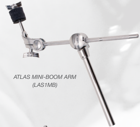
ATLAS MINI-BOOM ARM (LAS1MB)