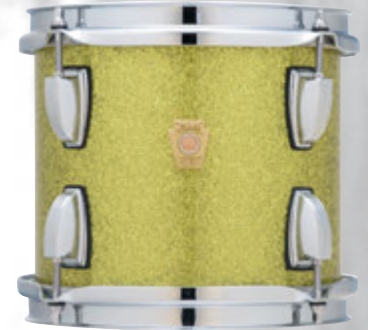
Olive Sparkle - 36