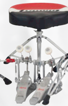
Atlas Pro Saddle Throne (LAP50TH)