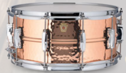
6.5x14" Hammered Copper Phonic w/ Imperial Lugs (LC662K)