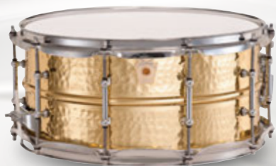
6.5x14" Hammered Bronze Phonic w/ Tub Lugs (LB552KT)