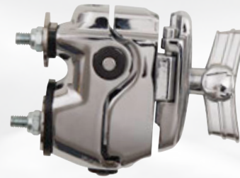
The A.T.L.A.S. Mount Integrated Lug Suspension System and Mounting Bracket (LAPAM1)