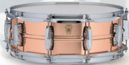
6.5x14" Copper Phonic w/ Imperial Lugs (LC660)