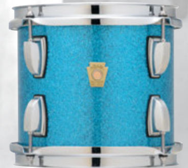
Teal Sparkle - 37