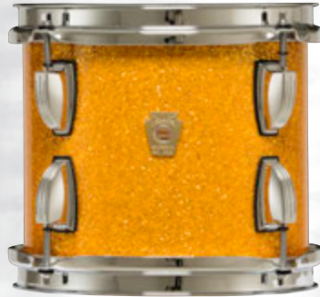
Gold Sparkle - 33