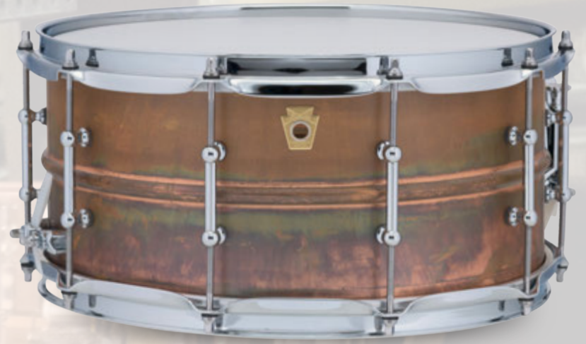
6.5x14" Raw Copper Phonic w/ Tube Lugs (LC663T)