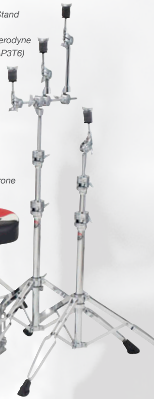
Atlas Pro Cymbal Boom Stand (LAP37BCS) (shown with optional Atlas Aerodyne Tilter Clamps LAP3T1 & LAP3T6)