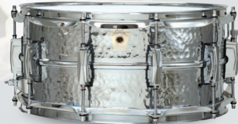
6.5x14" Hammered Supraphonic (LM402K)