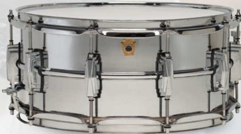
6.5x14" Supraphonic (LM402)