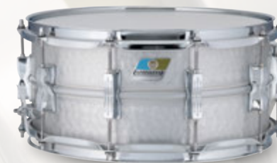
6.5x14" Hammered Acrolite w/ Bowtie Lugs (LM405K)