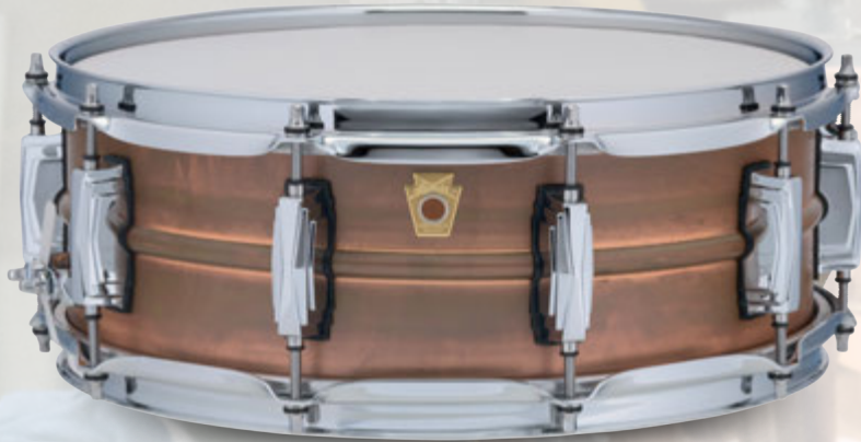
5x14" Raw Copper Phonic w/ Imperial Lugs (LC661)

With close to 100 years' experience building copper timpani, the newest member to the Ludwig USA snare drum range is the Copper Phonic snare drum. Featuring a dark raw copper finish that makes every one unique.