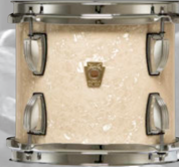
Vintage White Marine - NM