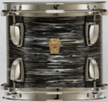
Vintage Black Oyster - 1Q