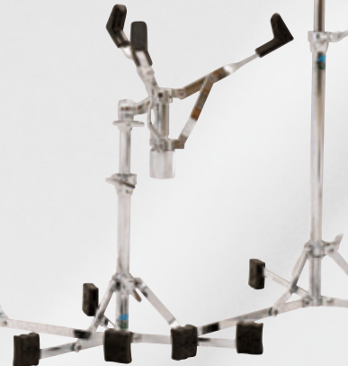
Atlas Classic Snare Stand (LAC21SS)