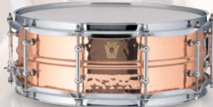
5x14" Hammered Copper Phonic w/ Tube Lugs (LC660KT)