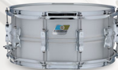
6.5x14" Acrolite w/ Bowtie Lugs (LM405C)