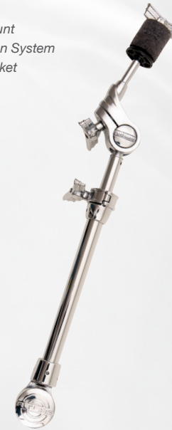
Atlas Classic Telescoping Cymbal Arm (LAC251CH)