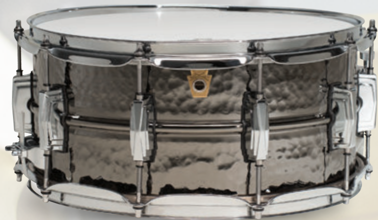
6.5x14" Hammered Black Beauty (LB417K)