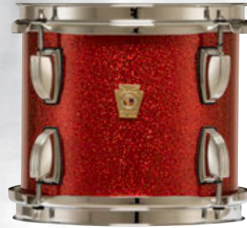
Red Sparkle - 27