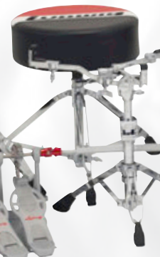
Atlas Pro Round Throne (LAP51TH)