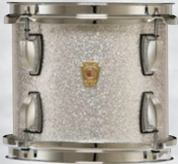
Silver Sparkle - OS