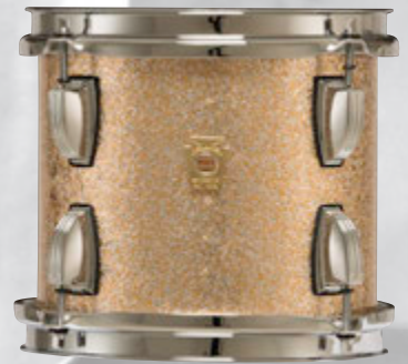
Shampayne - SP