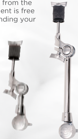
Atlas Aerodyne Tilter Clamp Self-Attaching Cymbal Arm with dual-axis tilter (LAP3T6 & LAP3T1)