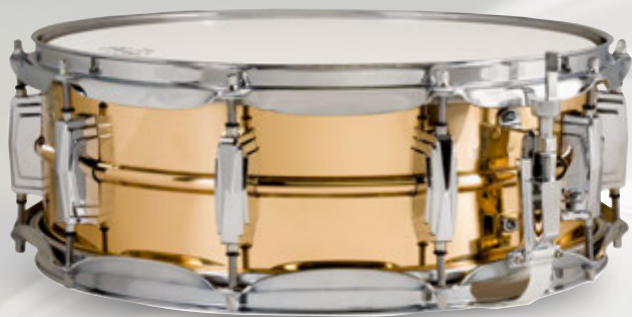
5x14" Smooth Bronze Phonic w/ Imperial Lugs (LB550)

A softer, darker alloy generally used for cymbal making, Bronze presents a unique blend of metal snare projection and the warmer tones of a wood drum.