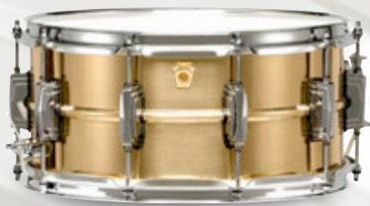
6.5x14" Smooth Bronze Phonic w/ Imperial Lugs (LC552)