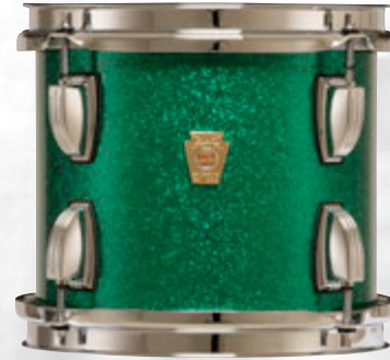
Green Sparkle - 54