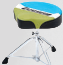
Atlas Classic Saddle Throne (LAC48TH)