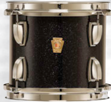
Black Sparkle - OR