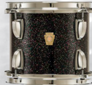
Black Galaxy - BG