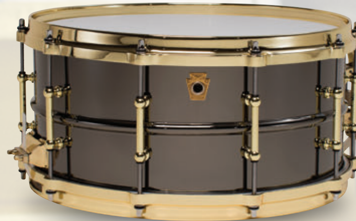
6.5x14" Black Beauty w/Brass Hardware (LB417BT)