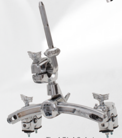
The A.T.L.A.S. Arch Rail-Mounted Bass Drum Tom Holder (LAC2983MT)