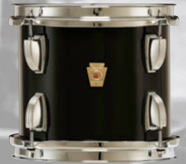
Black Cortex - 0G