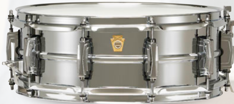
5x14" Supraphonic (LM400)

The sound that fueled the most hit recordings in music history, the Ludwig Supraphonic is the performance-proven snare choice of the pros. From Jazz to Metal, Ludwig's Supraphonic 400s provide the perfect sound in the studio or stage. The USA-made chrome-plated, seamless, beaded aluminum shell produces a bright, crisp attack with the perfect balance of full resonant tone and snare crack.