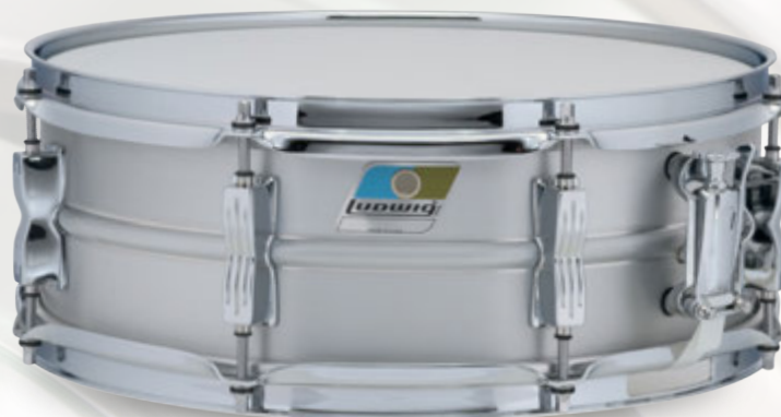
5x14" Acrolite w/ Bowtie Lugs (LM404C)

Originally introduced in 1963 as a student drum, the Ludwig Acrolite quickly became the choice of pro players in need of dry, cracking snare tone.