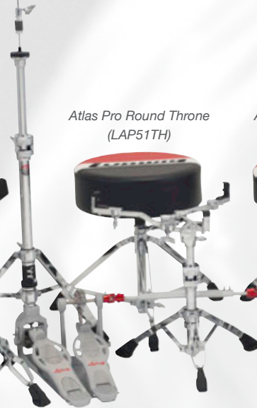
Atlas Pro Round Throne (LAP51TH)