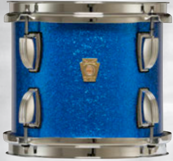
Blue Sparkle - 32