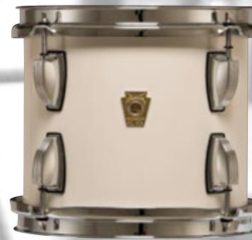
White Cortex - 0F