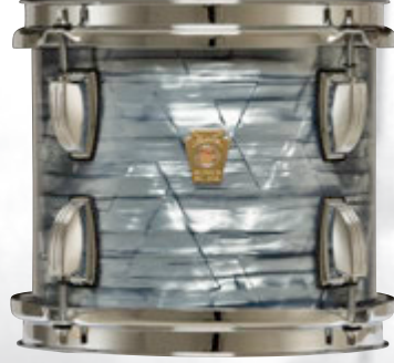
Sky Blue Pearl - 52