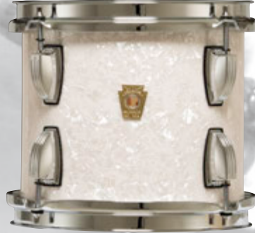
White Marine Pearl - 0P