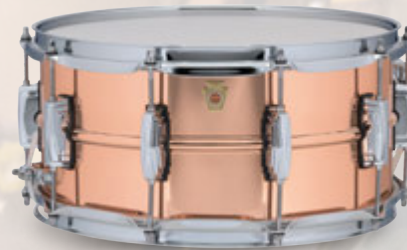
6.5x14" Copper Phonic w/ Imperial Lugs (LC662)