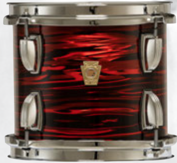
Red Oyster Pearl - RP