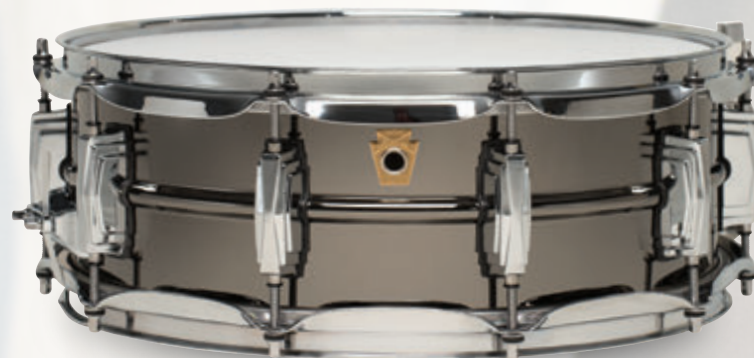
5x14" Black Beauty (LB416)

The legendary Black Beauty snare drum is one of the primary reasons Ludwig is “The Most Famous Name In Drums.” The drum is constructed of a single sheet of brass that is machine drawn into a seamless beaded shell, then nickel-plated with a beautifully exquisite finish. A true American original, the Black Beauty provides a warm, round metallic tone that is often imitated, but never duplicated.