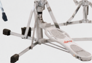
Atlas Classic Cymbal Stand (LAC25CS)