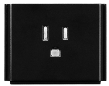
FIG. 1 HPX-P200-PC-US AC POWER MODULE

The HPX-P200-PC-US AC Power Module ( FG561-01 ) is designed to be used exclusively in the AMX HPX-600/900/1200/1800 or HydraPort ^{\circledR} Touch Chassis (HPX-MSP-7/10). The HPX-P200-PC-US module provides power connectivity for US plug types to the HydraPort chassis.