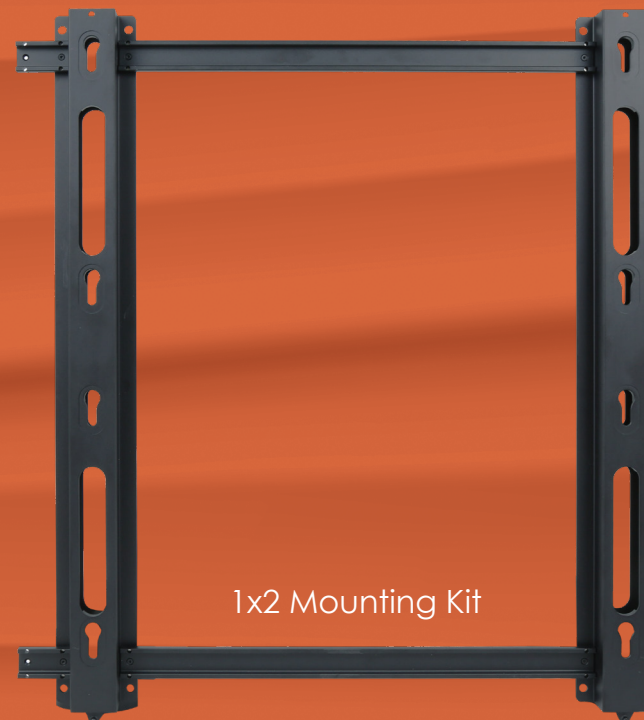
1x2 Mounting Kit