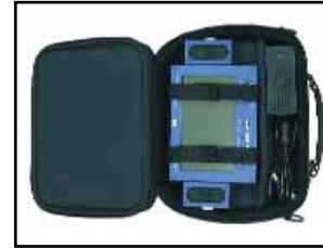
Optional Carrying Case

Power: 12 volts, 20 watts, 110/220 volt supply included.