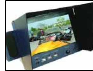
Removable Sunshade Included