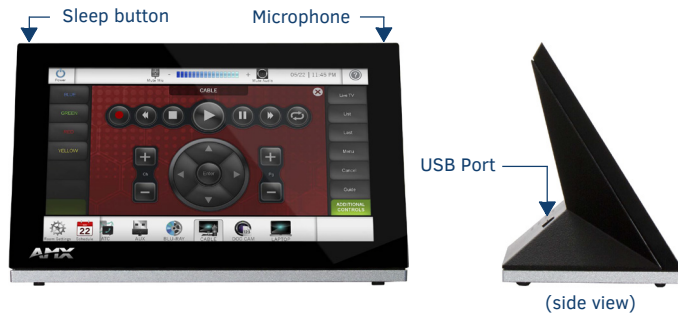
FIG. 1 MT-702

The MT-702 (FG5969-53) 7" Modero G5 Tabletop Touch Panel features the G5 Graphic Engine, Quad Core Processor, and a capacitive multi-touch display. The touch panel features advanced technology empowering users to operate AV equipment seamlessly, while providing the ultimate in audio and video quality.