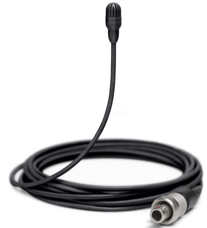
TwinPlex™ TL46 Subminiature Lavalier Microphone