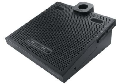
MXC615 Conference unit

*Dual Delegate operation requires a firmware update