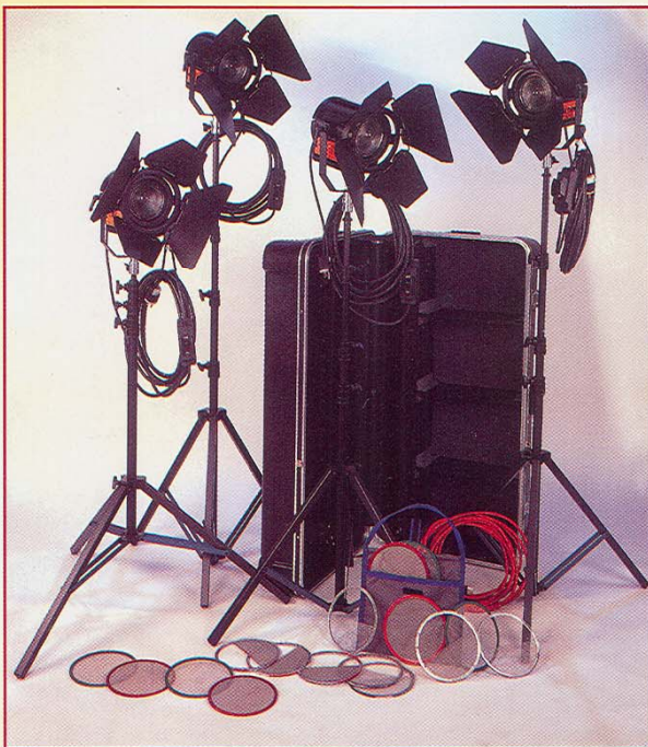
Altman "Model Pac" Lighting Kit

Refer to Page 5 for exact for kit contents.