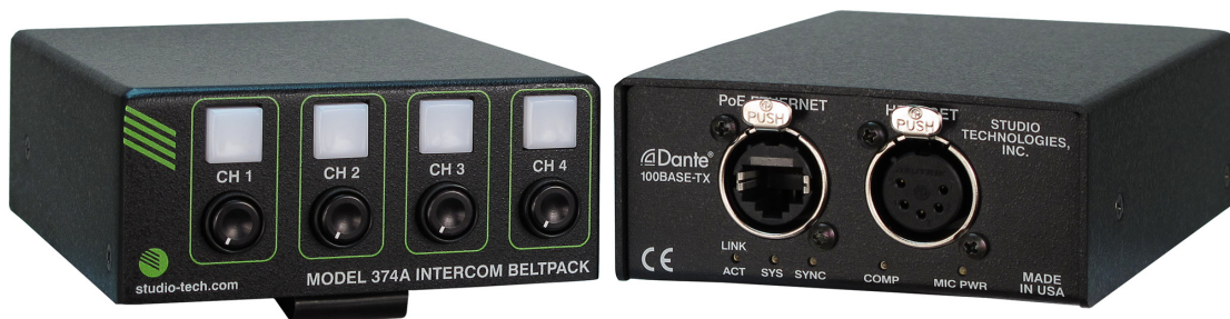
Figure 1. Model 374A Intercom Beltpack top and bottom views

The STcontroller software application is used to select the unit’s operating parameters. Four talk pushbutton switches can be configured for optimal operation. Four push-in/push-out (“pop out”) rotary controls make it easy to set and maintain the desired headphone output level. The Model 374A’s enclosure is made from an aluminum alloy which offers both light weight and ruggedness. A stainless steel “belt clip,” located on the back of the unit, allows direct attachment to a user’s clothing.