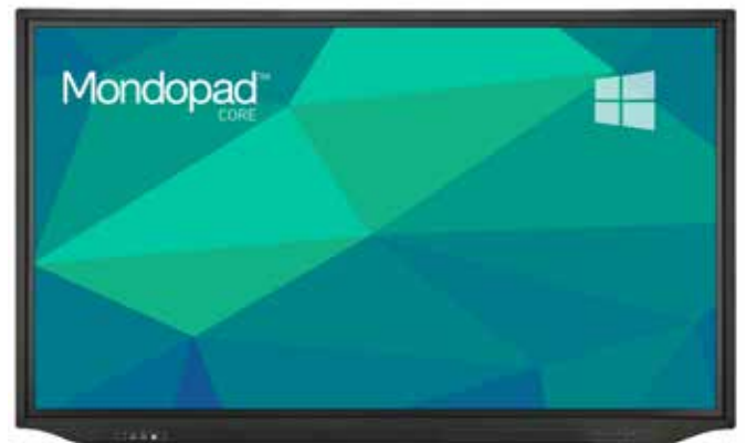
Mondopad Core with PC Part Numbers: INF55MC31, INF65MC31, INF75MC31, INF86MC31

Upgrade to a Mondopad Core with an 7th generation Intel i7 PC to build a more powerful touchscreen solution for your specific need. Maximize the power of Windows 10 Pro on a fluid, multi-touch screen to bring your special application to life in any setting.