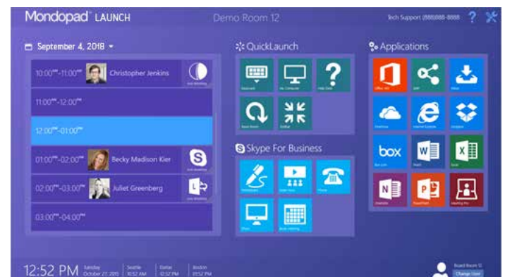
QuickLaunch Professional Edition

Montage, from DisplayNote, offers simple but powerful casting so that you can easily share content wirelessly from your laptop or mobile device. Montage allows up to six people to cast content simultaneously. The main user at the screen can choose which user to show as the active screen, and other users can then annotate from their personal device on to the casted image for all to see.