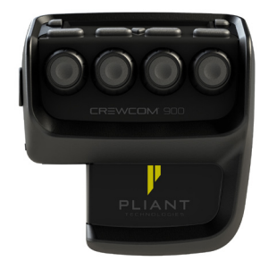
CRP-44-900 4-Volume / 4-Conference 900MHz Radio Pack