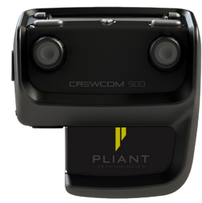
CRP-22-900 2-Volume / 2-Conference 900MHz Radio Pack