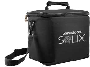
Travel Case with Removable Foam Insert & Shoulder Strap