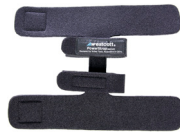
PowerStrap by Tether Tools