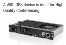
A WiDi OPS device is ideal for High Quality Conferencing