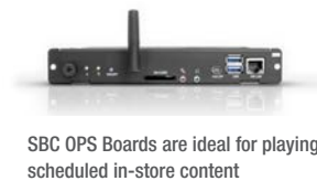
SBC OPS Boards are ideal for playing scheduled in-store content

Future-proof your display with the NEC option slot. This slot provides connectivity for Open Pluggable Specification (OPS)-compliant devices, creating a seamless integration across a variety of accessories.