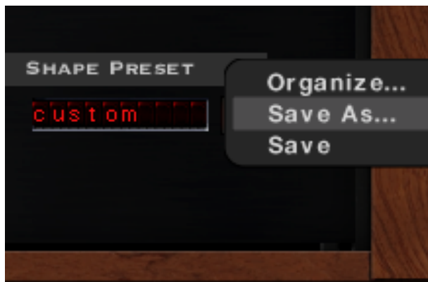
Figure 6: Saving a new Shape Preset