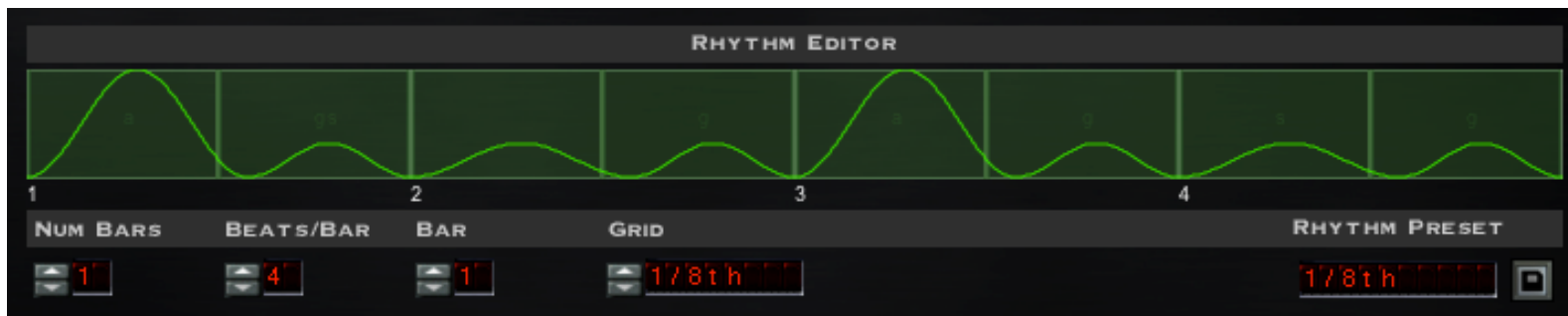
Figure 7: Tremolator's Rhythm Editor Section