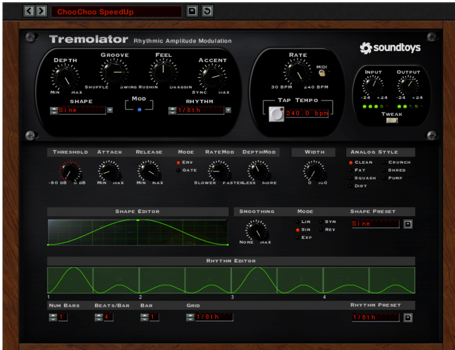
Figure 1: Tremolator's Control Panel and Tweak Menu