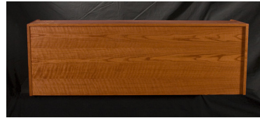
Left image of the Desktop Rolltop Custom Rolltop shows the rolltop tambour door open (rolltop door descends inside rear of desk stopping behind table). Right image of desk shows fully finished desk rear.