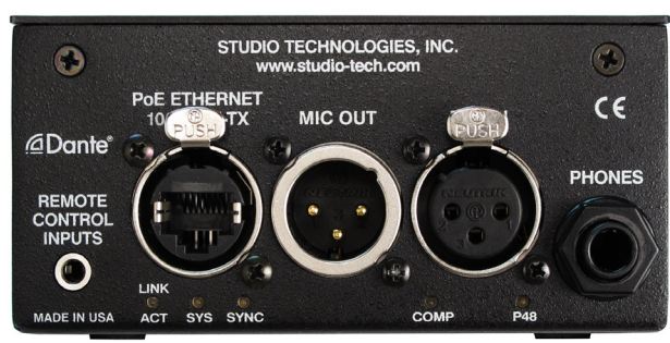
Figure 1. Model 206 Announcer's Console front and rear views