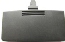
Battery cover 5046953