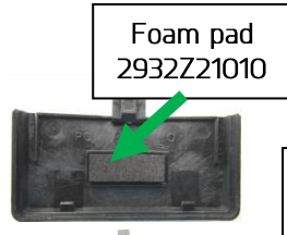
Foam pad 2932Z21010