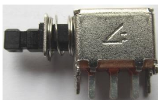
Switch (ON/OFF) 0040E02180