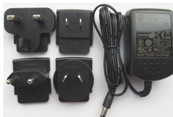
Level 5 Powersupply 7801H00130