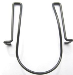
Belt clip 2932Z16010