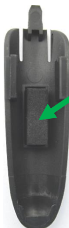
Foam pad 2931Z39010