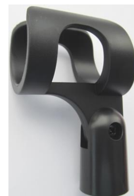
Optional, Stand adapter SA63, 6001H63010