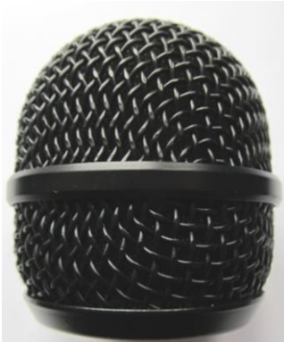
Grid cap HT40, 9999N07180