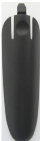
Battery cover 2931Z13020