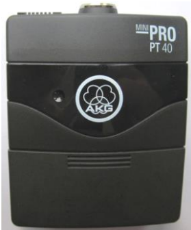
Housing complete, Incl. MiniXLR, Batt. Contacts, etc. 2932M04050