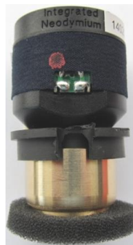
Capsule HT40, 1400M40010