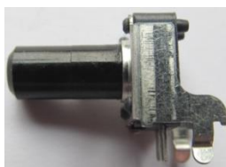
Poti 10K (Volume) 0021E00680