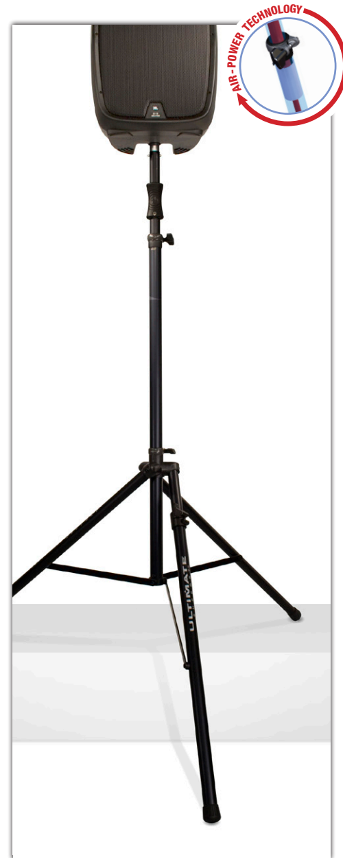
TS-110BL Air-Powered Tripod Speaker Stand - Extra Tall & Includes Leveling Leg