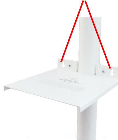
(2) Key hole Slots for Mounting to a Flat Surface