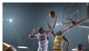
12x Optical Zoom