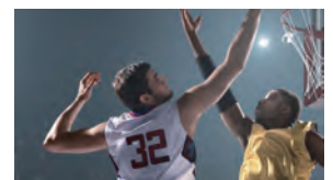
24x Dynamic Zoom in HD Zoom

Dynamic Zoom combines Optical Zoom plus Pixel Mapping—focusing on a smaller image area for lossless 24X Zoom