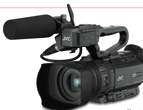
Shown with optional microphone