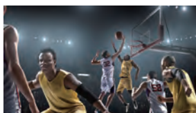
Original Image No Zoom

The ultra high quality imagery begins with a precision 12x F1.2–3.5 optical zoom lens (35mm equivalent: 29.6–355mm). When shooting in the HD mode, Dynamic Zoom combines optical zoom and pixel mapping from a 4K image sensor to create seamless and lossless 24x zoom. This allows the camera to have a long zoom range while retaining its compact form factor.