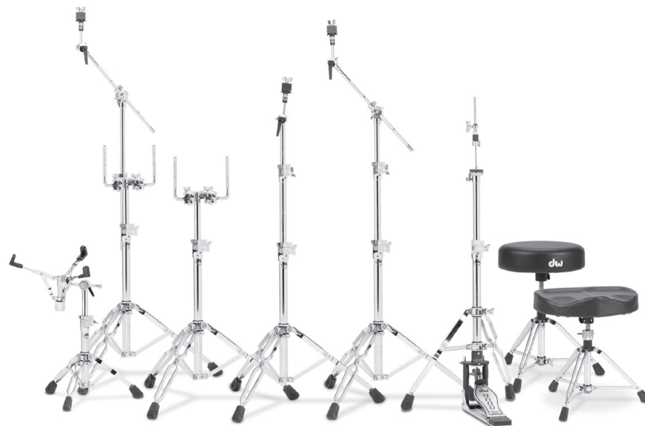
9300 snare drum