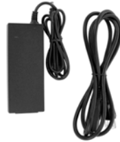
Power supply and cable