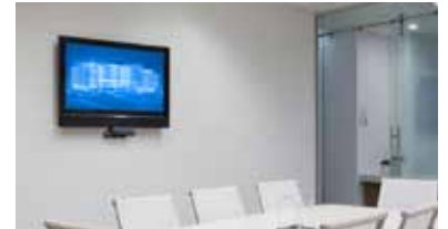
Shown attached to the wall

Nearly invisible shelf supports HDS-WHDI100 Receiver unit and matches any décor