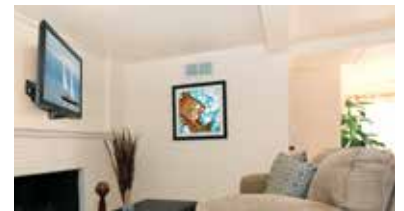
Shown attached to the wall mount